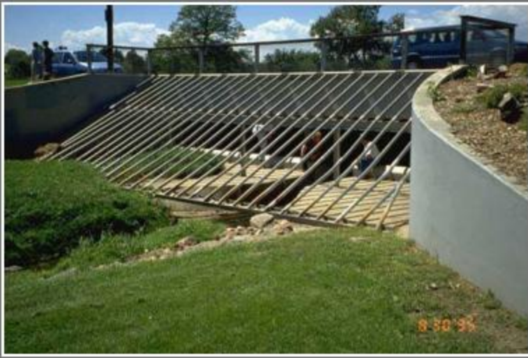
Photograph CU-1 —Public safety considerations for long culverts should be accounted for with culvert designs such as with this collapsible trash rack at a park-like location.