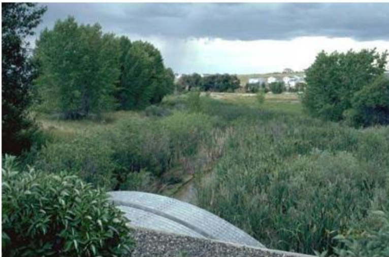
Photograph CU-2 —Culverts can be designed to provide compatible upstream conditions for desirable wetland growth.