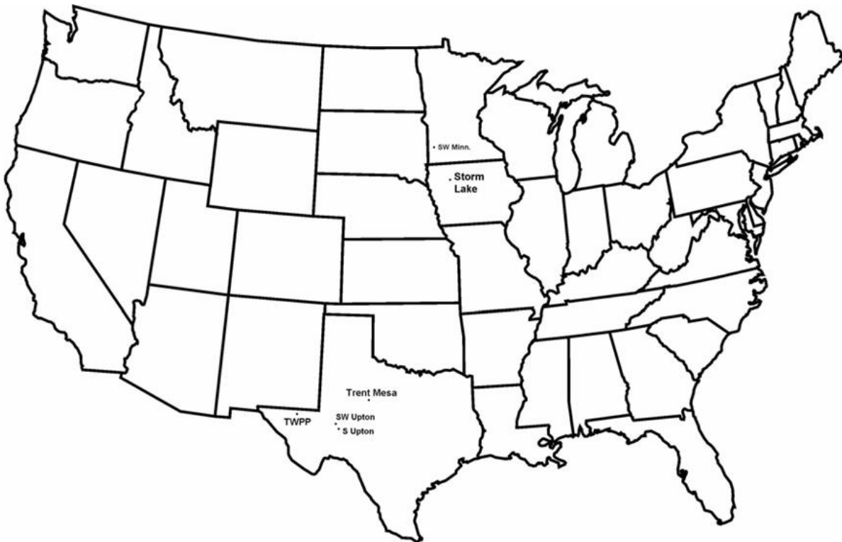
Figure 1-1. Locations of monitored wind power plants