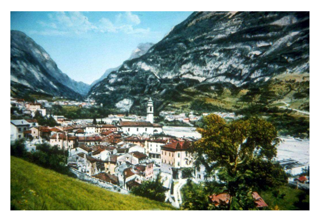
Figure 2c: The town of Longarone, located downstream of the Vajont dam, before the Mount Toc failure in October 1963.

Figure 2b: During the filling of the Vajont reservoir the toe of the slope on Mount Toc was submerged and this precipitated a slide. The mound of debris from the slide is visible in the central part of the photograph. The very rapid descent of the slide material displaced the water in the reservoir causing a 100 m high wave to overtop the dam wall. The dam itself, visible in the foreground, was largely undamaged.