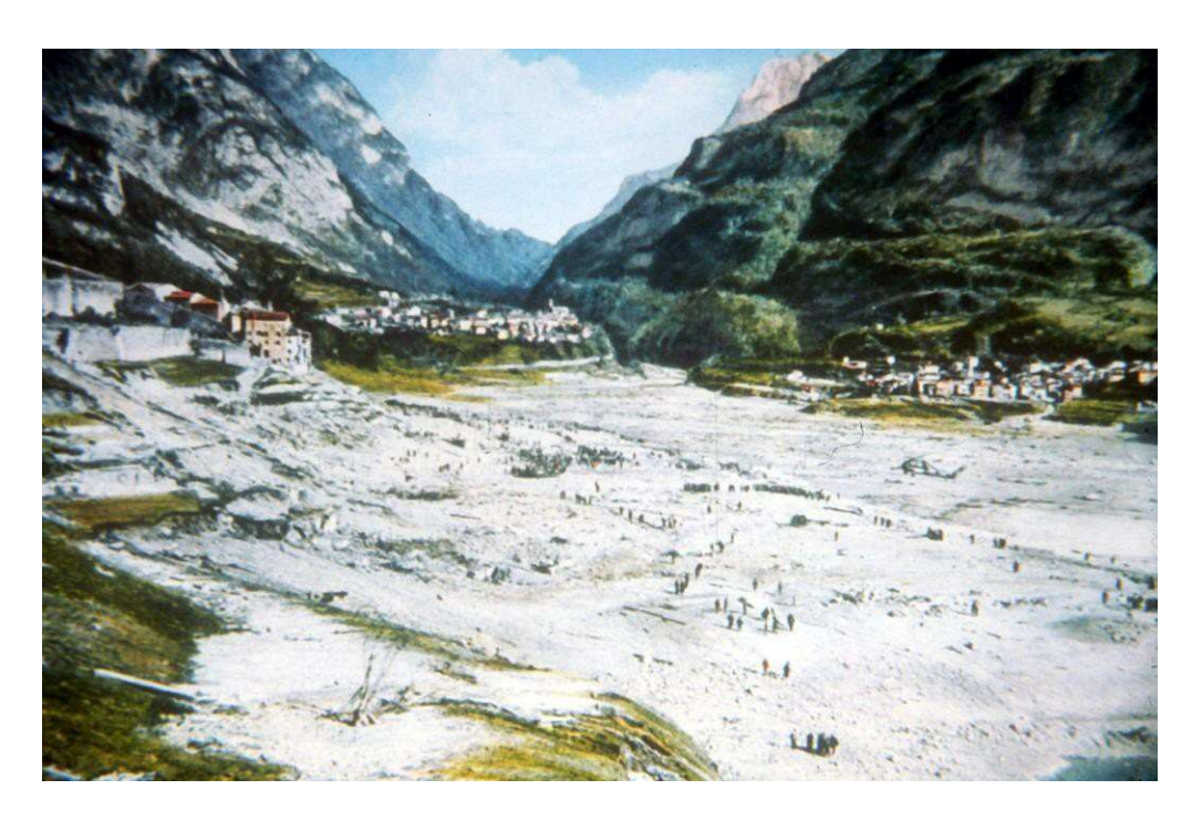
Figure 2d: The remains of the town of Longarone after the flood caused by the overtopping of the Vajont dam as a result of the Mount Toc failure. More than 2000 persons were killed in this flood.