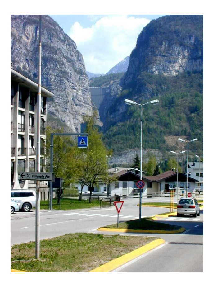
Figure 2e: The remains of the Vajont dam perched above the present town of Longarone.

Figure 2d: The remains of the town of Longarone after the flood caused by the overtopping of the Vajont dam as a result of the Mount Toc failure. More than 2000 persons were killed in this flood.