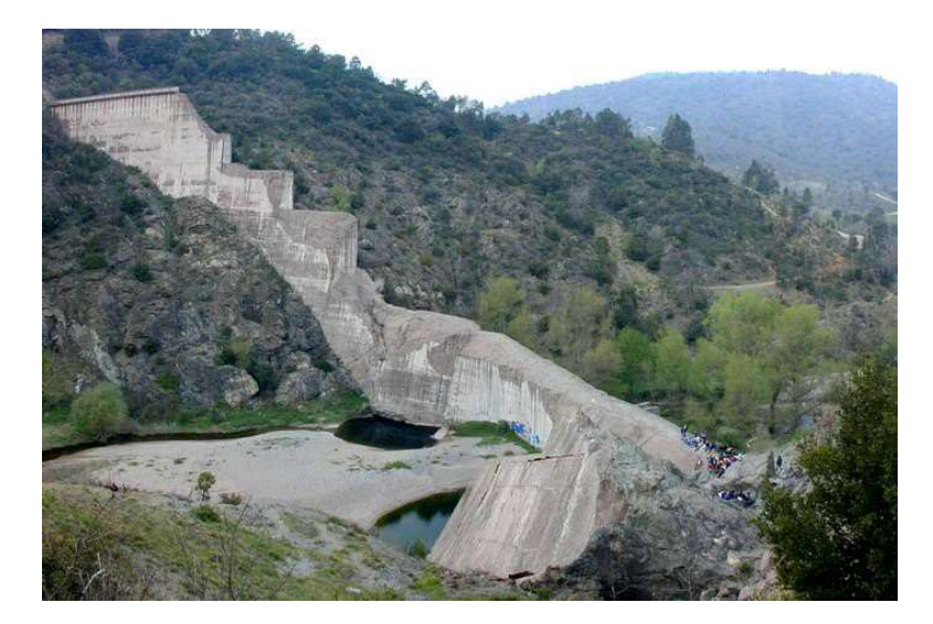
Figure 1: Remains of the Malpasset Dam as seen today. Photograph by Mark Diederichs, 2003.

In December 1959 the foundation of the Malpasset concrete arch dam in France failed and the resulting flood killed about 450 people (Figure 1). In October 1963 about 2500 people in the Italian town of Longarone were killed as a result of a landslide generated wave which overtopped the Vajont dam (Figure 2). These two disasters had a major impact on rock mechanics in civil engineering and a large number of papers were written on the possible causes of the failures (Jaeger, 1972).