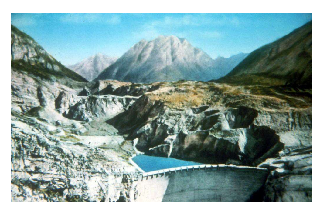
Figure 2b: During the filling of the Vajont reservoir the toe of the slope on Mount Toc was submerged and this precipitated a slide. The mound of debris from the slide is visible in the central part of the photograph. The very rapid descent of the slide material displaced the water in the reservoir causing a 100 m high wave to overtop the dam wall. The dam itself, visible in the foreground, was largely undamaged.